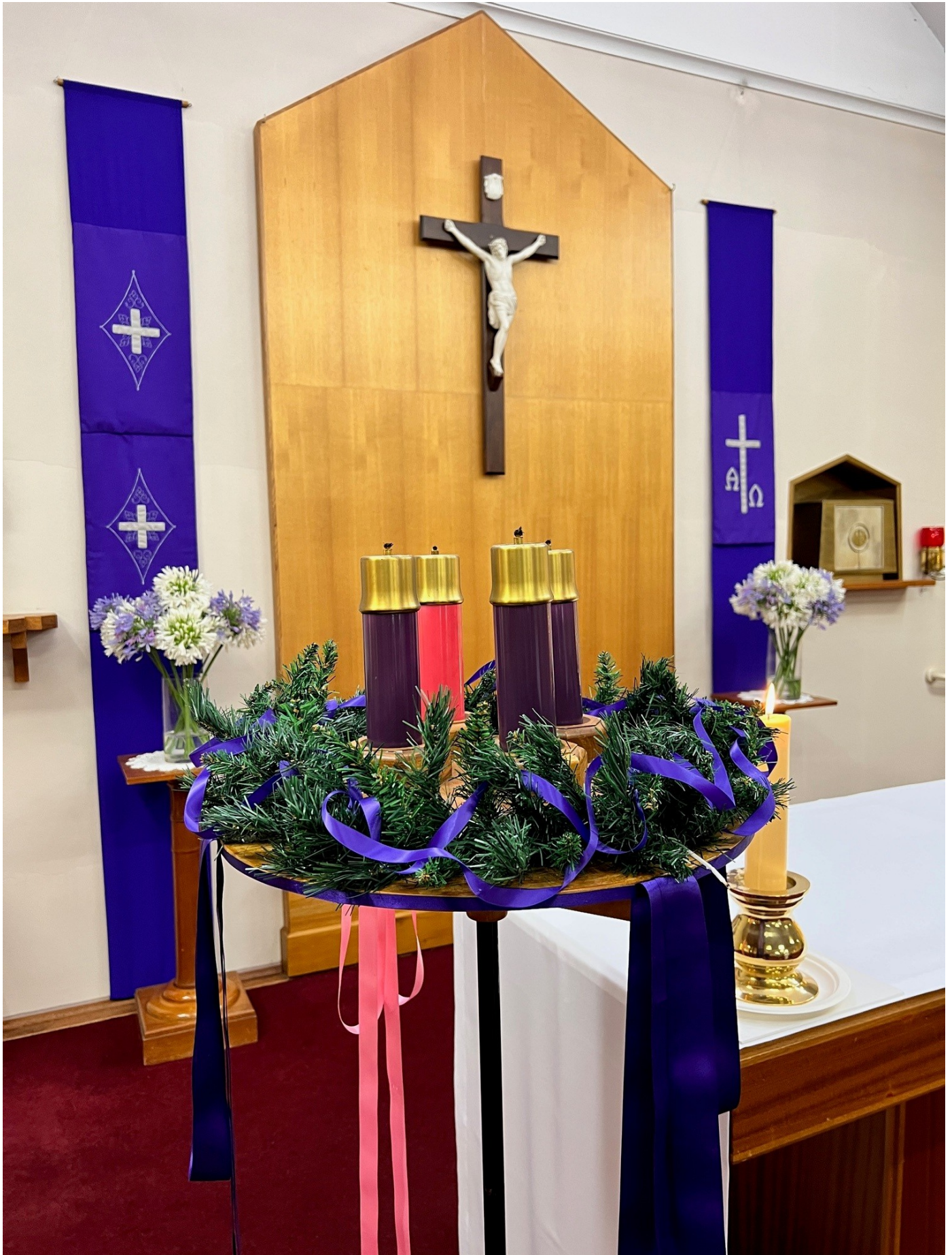
Season of Advent